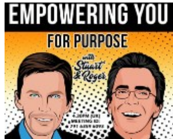
Mon 5 Apr - Empowering you for Purpose! Engaging in the Sphere of the Family Online - Zoom