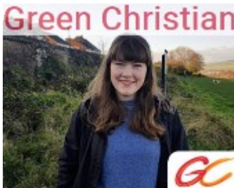
Wed 7 Apr - Green Christian Workshop: What you can do about COP26 with Rachel Mander Online - Zoom