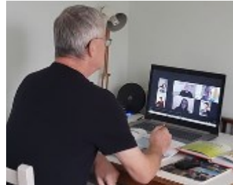
The Power of English in Mission