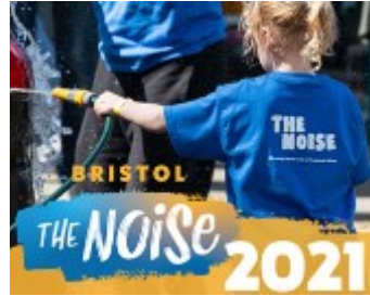
The Noise 2021 Update - Volunteer Resources For Your Church