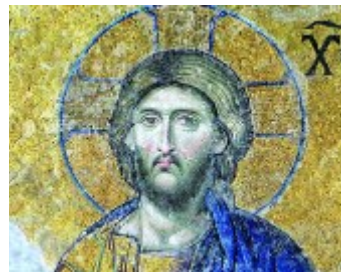
Tue 13 Apr - 'Sharing our Story' – Online Conversations for Catechists: TBC Online - Microsoft Teams