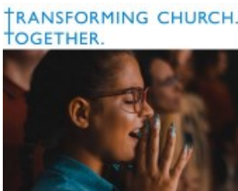
Tue 6 Apr - Transforming Church. Together (Open workshop for all) Online