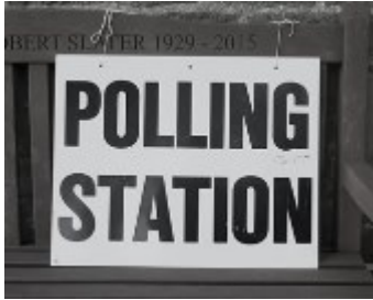
Bristol Mayoral Election 2021 Candidates