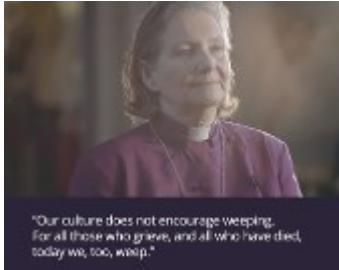
The short film 'Bristol Remembers' marks the anniversary of the first lockdown