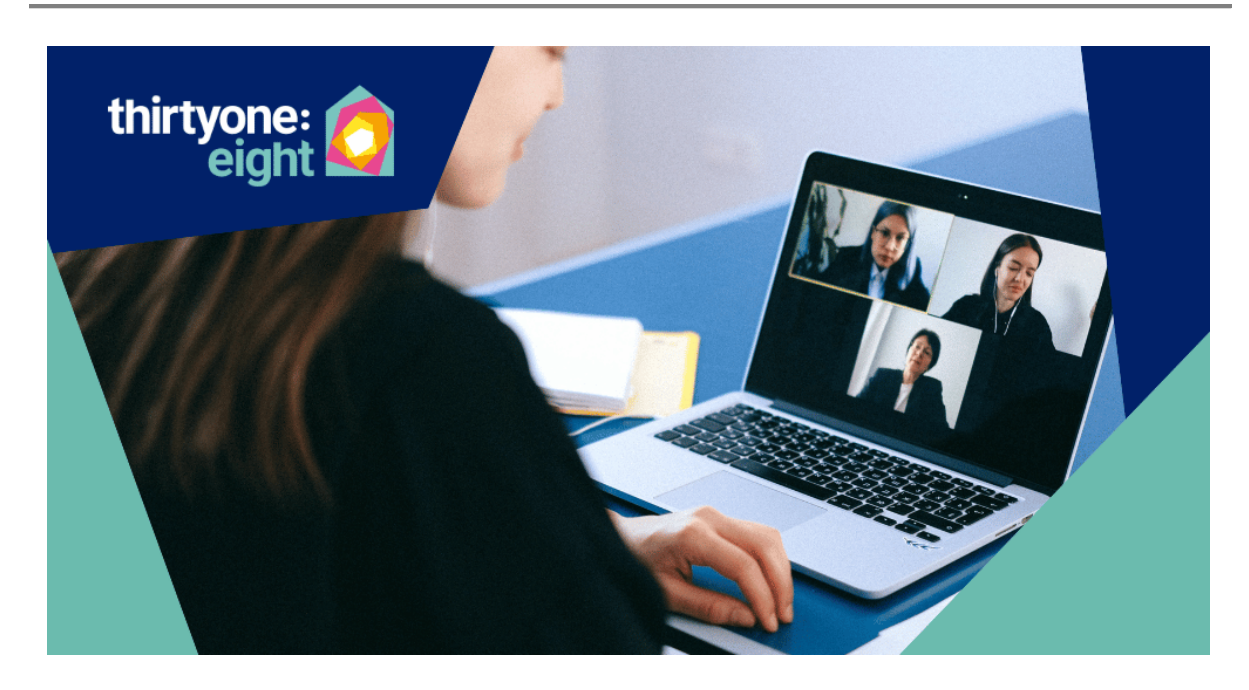
Training Focus | January 2024

From: Sarah, Thirtyone:eight To: ctcinfohub@gmail.com Subject: Training Focus January 2024 Date: 15 January 2024 08:01:16