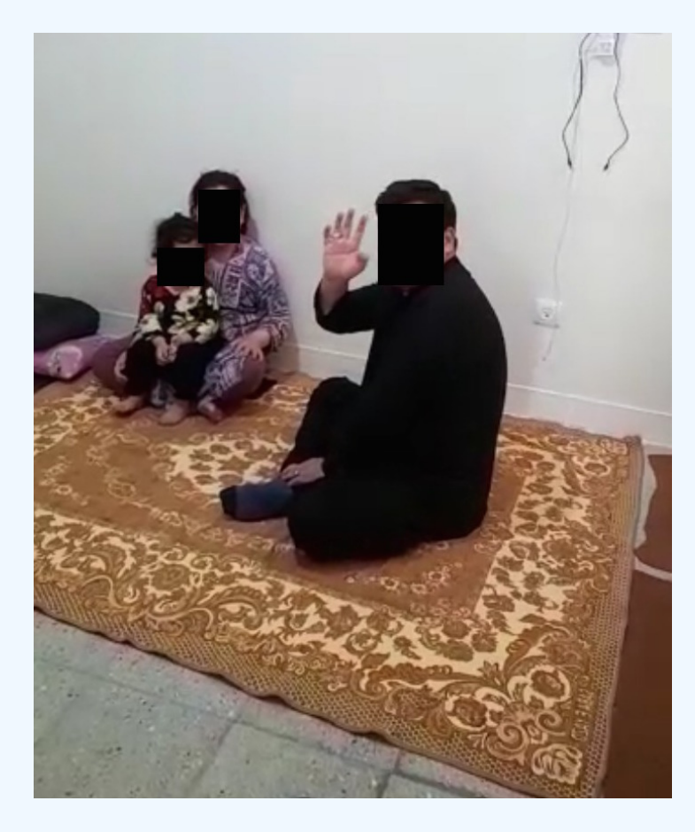
In their new, but very empty, home for now

For now, they have managed to find a small apartment to stay in, but this has used up all they had left - they had to sell everything they have. The place is empty except for a small rug and blanket on the floor where the