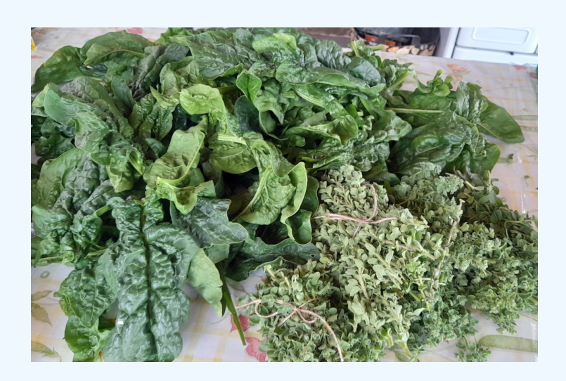
A sample of spinach and oregano from Goshen.

Here in Greece, all of our beneficiaries are worried about the ever increasing cost of living. With the loss of government support, and many