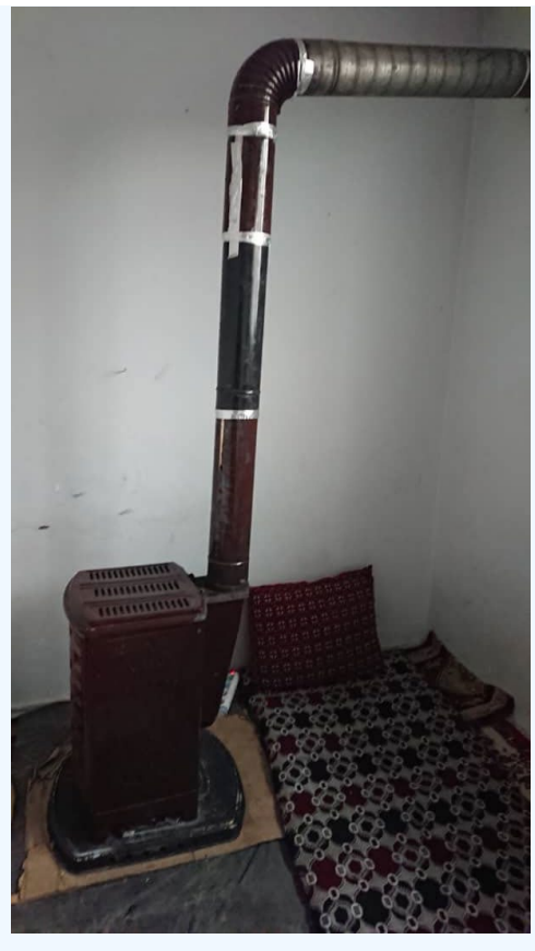
Please thank God for His provision, and for making a way of getting some help to them in such difficult

have died this past month because temperatures have been below minus 22 degrees celsius, without heating or fuel.