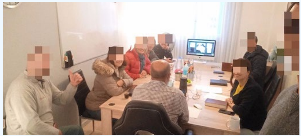
Our classes are back in full swing

New families have been arriving, and instantly feel at home and welcome at the House of Faith