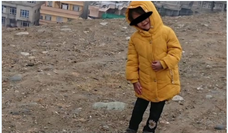
One of "A"'s children - please pray for these precious ones.