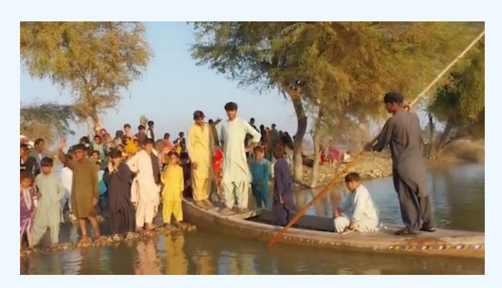
Some of the people our young couple visited

We are so humbled that despite the intense hardships and extreme persecutions, some of the flock are going out and serving others!