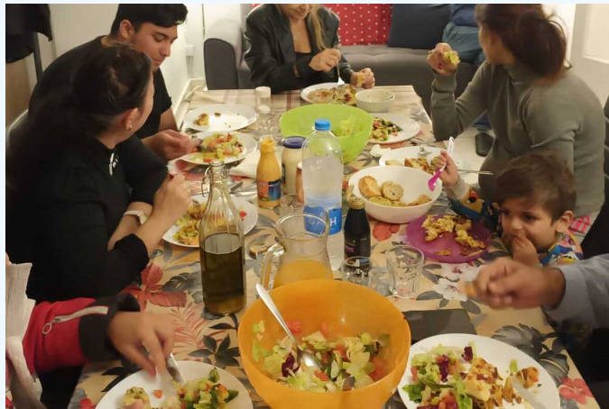
Fellowship meal in the House of Faith

It's that time of year when families get together to celebrate... but also when those who are separated/estranged from family can feel cut off and alone, and it can be painful. For many believers from the