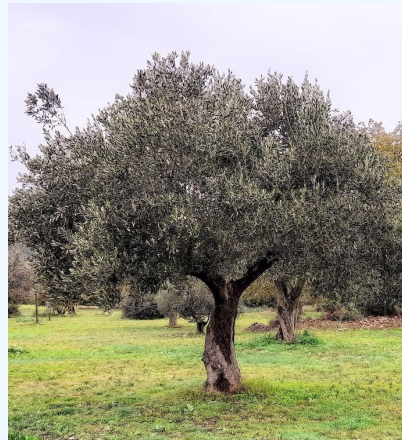
Cultivated olive tree - full of fat, oil-filled fruit