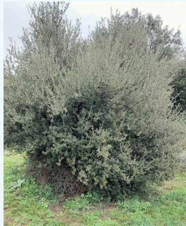
Wild olive tree - with no fruit (or very tiny fruit)

As we continue to harvest, (both with the olives and in our work as ICC) we are all so encouraged to keep pressing on and maturing in Christ, producing good fruit with the help of the Holy Spirit! We hope this will also encourage you.