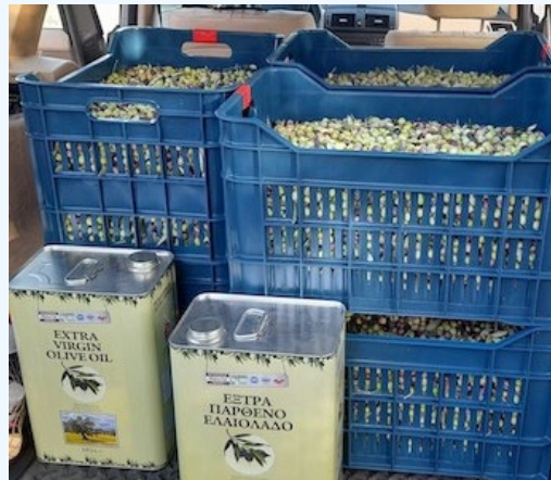
First batch ready to go to the olive mill

As we picked olives, we discussed the biblical picture of the olive tree - a symbol of God's people. We noticed how the wild olive trees produce less fruit and their fruit is pretty tiny and useless. The cultivated trees on the other hand, are laden with fat, oil-filled fruit. We were reminded of how as gentiles, like the wild olive tree, we are grafted into the cultivated tree of the commonwealth of Israel.