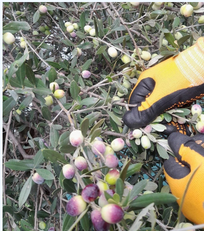
Picking Goshen's olives for oil, by hand