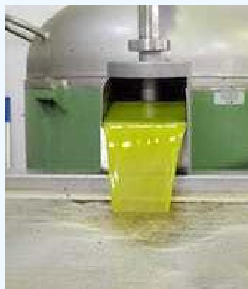
Pure, golden olive oil from Goshen olives!

Goshen has some grafted trees and ordinarily you would never graft a wild branch into a cultivated tree - it's always the other way around - cultivated branches are grafted onto wild trees to make the wild trees more productive... but what God has done is the opposite! ("contrary to nature" Romans 11:24) What a beautiful