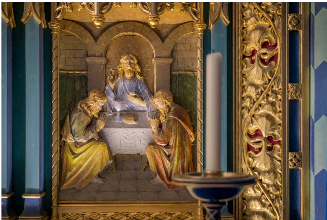
A carving from Cartmel Priory in Cumbria.

From: National Churches Trust To: ctcinfohub@gmail.com Subject: Happy Easter from the National Churches Trust Date: 28 March 2024 16:59:55