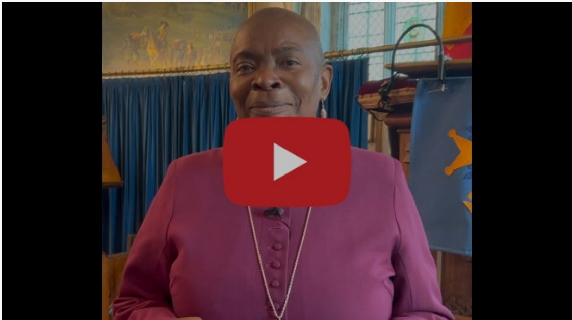
Rt Revd Rose Hudson-Wilkin, the Bishop of Dover, shares the One Thing she has resolved to do to fight modern slavery this year #DOT4ASD #AntiSlaveryDay

Please forward this newsletter to your friends and colleagues and encourage them to sign up to receive it regularly.