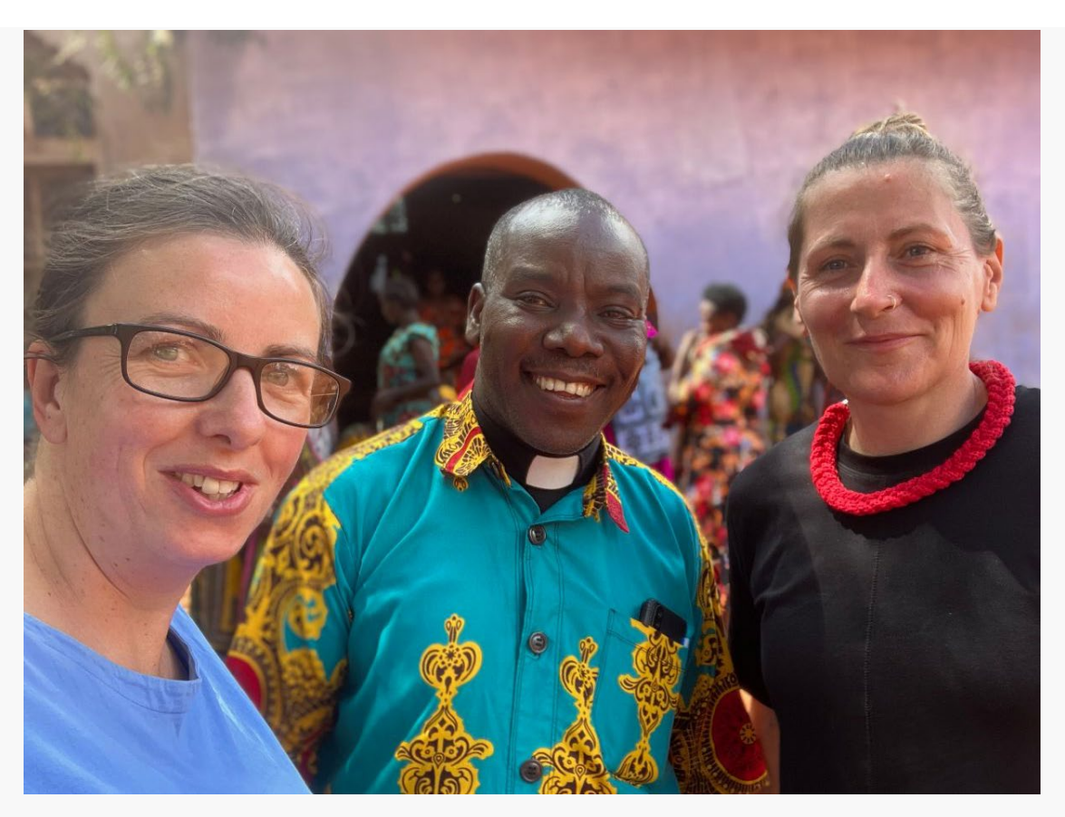
Protecting children from modern slavery

The Clewer Initiative launches a new safeguarding resource for worshipping communities around the world