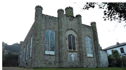
St Michael & All Angels, Penwerris

www.trurocathedral.org.uk/whats-on/threads-through-creation-art-exhibition-8725-8725/tue-8-jul-2025-10-00-am