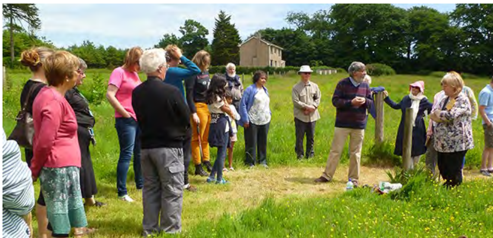
Dor Kemmyn Peace Field