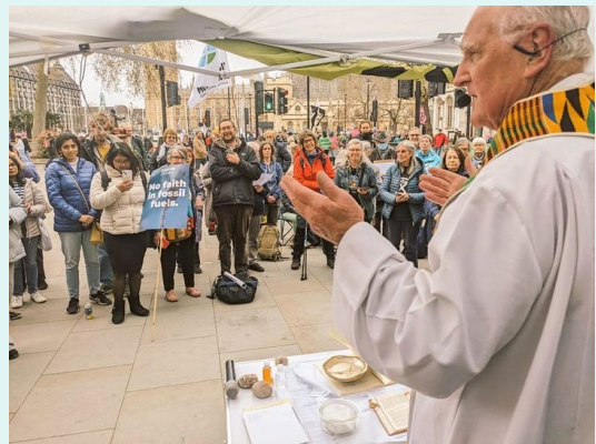
Above: CCA members led in worship by members of the Laudato Si movement.