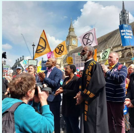
Right: Worship led by our friends in Black Majority Churches.