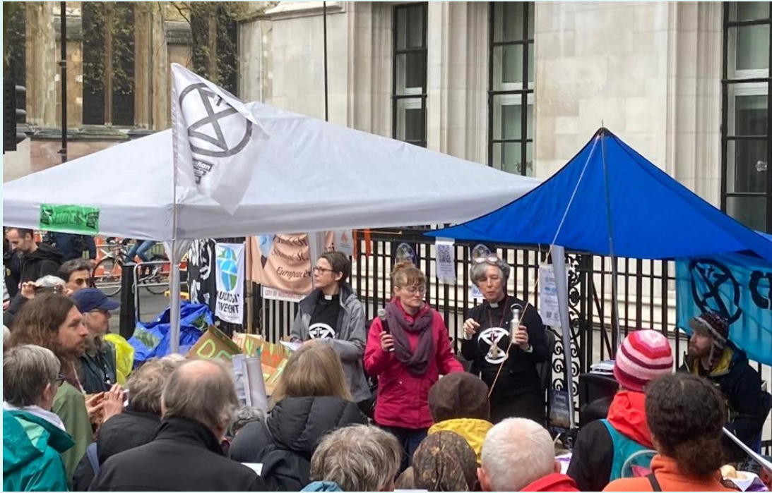
Above: Preparing for Anglican worship at the Faith Hub.