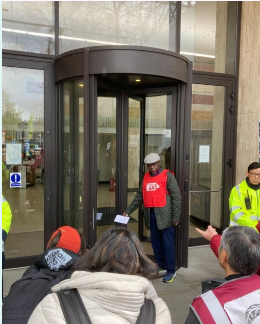
Left: The doors are locked and the police are called when Lord John Sentamu, former Archbishop of York, tries to deliver a letter to Shell.